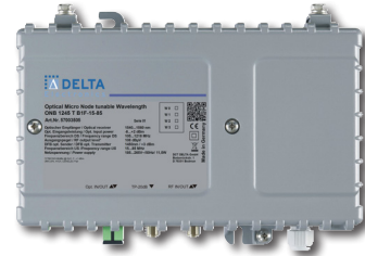
see ONB T on the image