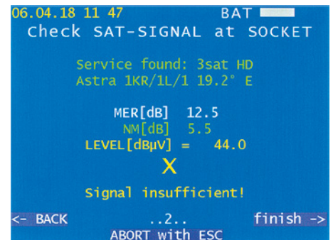
One of the wizards: simple and guided check of the signal quality at the antenna socket.