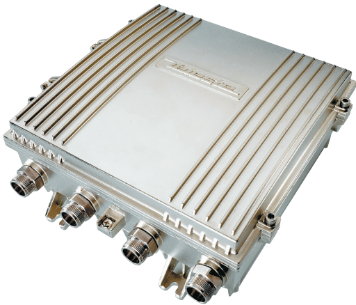
AC3000 Intelligent Amplifier

Adjustments All the adjustments are electrical and controlled with a management interface. No plug-in attenuators or equalisers are needed.