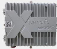
Shell R-PHY Node