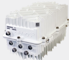
Ripple R-PHY Node