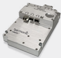
Pebble R-PHY Device

Turnkey deployments simplify operations to leverage existing infrastructures and minimize hardware investment. The entire solution is built to work with third-party components and is industry standard compliant.