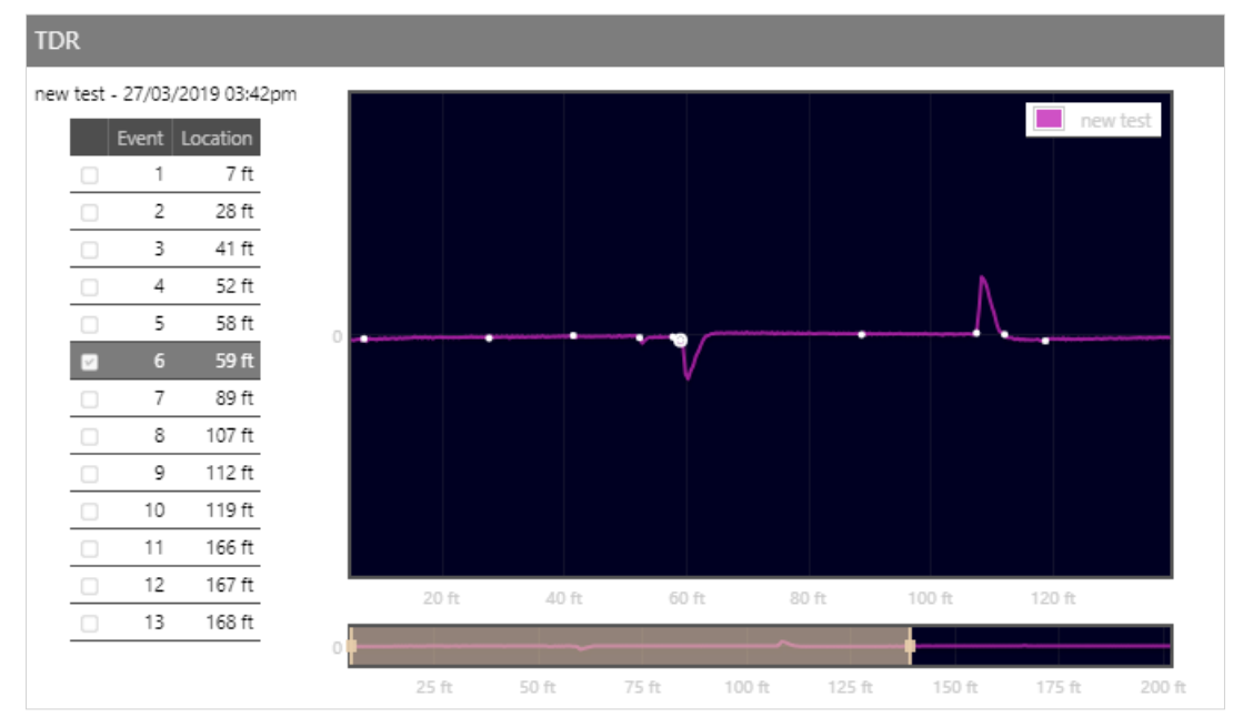
Events listed with trace in StrataSync